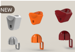
Juice extraction kits

A system developed by Zummo to assemble and disassemble the balls of the kit in just one movement.